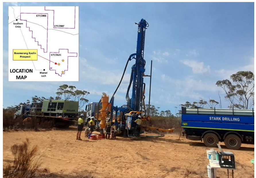
Figure 1. Rig 2 from Stark Drilling collaring 22BMRC001 (the first 2022 RC hole at the Boomerang Prospect) with the Kula on site geologist set up and ready to log. Project and Prospect location shown in inset map.

Kula Gold Limited (KGD) is pleased to announce that reverse circulation (RC) drilling of the Boomerang Prospect at their 100% owned Marvel Loch – Airfield Project has resumed following the festive break.